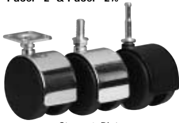
Stems & Plates sold separately