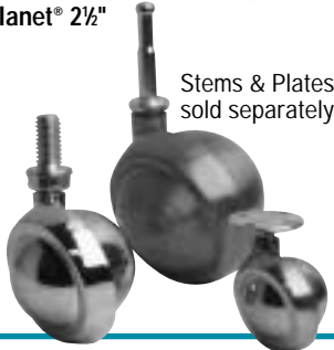
Stems & Plates sold separately